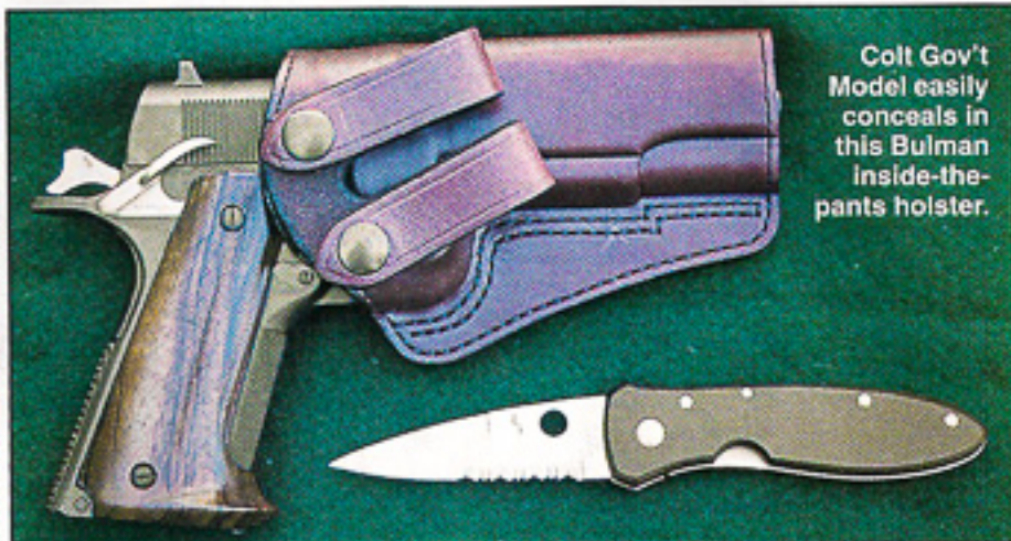
Colt Gov't Model easily conceals in this Bulman inside-the-pants holster.

The inside-the-pants holster is one of the best means of concealing a full-sized handgun like the Colt Gov't Model, which is still instantly available, and the new rig from Bulman Gunleather is one of the best I've seen. Of special note it's made from two thin pieces of cowhide so that both the inside and outside surfaces of the pouch are smooth side out. This smooth interior surface works and exacting wet molding ensures the gun is held