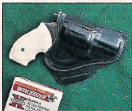
BlackHawk's Speed Classic provides concealment with speed and security.

split down the front and fully enclosed the triggerguard. A spring held the split front of the pouch closed and one drew the concealed revolver by pulling it through the split front until the triggerguard cleared. After Berns-Martin went out of business, both Bianchi and Safariland made similar shoulder holsters. These secure, fast-into-action shoulder rigs were very popular with those who preferred shoulder holsters for concealed carry. BlackHawk has resurrected this classic in their CQC Holster line as the Speed Classic. However, now it's configured as a hip holster.