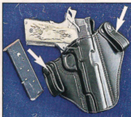
Widespread belt loops on Bulman PDL enhance carry comfort.

Bulman Gunleather's Model PDL is an inside-the-pants concealment rig similar to the classic pancake holster. However, the belt slots in the leading and trailing edges have been replaced with snap-fastened belt loops. These belt loops are securely fastened to the leading and trailing edges of the PDL with screw-post fasteners. Each belt loop uses a "pull the dot" heavy-duty snap fastener to provide easy placement on and removal of the PDL from one's belt. The leading and trailing edge tabs are shaped to conform to the wearer's hip for comfort and to further secure the holster to the waistband. The open top pouch is neatly "wet fit" for a M1911 and, with our sample, the fit with my Wilson Combat tuned Colt is very tight for security. The pouch fully encloses the triggerguard to prevent