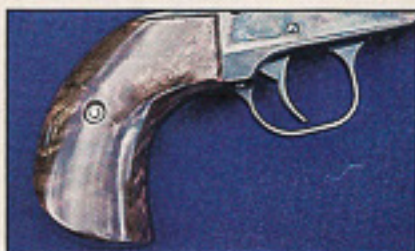
Burl walnut grips on BCA Sheriff's Model are by Jim Martin.

grip materials, I chose extra fancy burl walnut with a deep, high-gloss, hand-rubbed oil finish. The finished grips fit the birdshead grip frame as though they grew from it. The hand-filling grips are designed for heavy recoiling SA revolvers, as this .45 Colt caliber custom Sheriffs Model