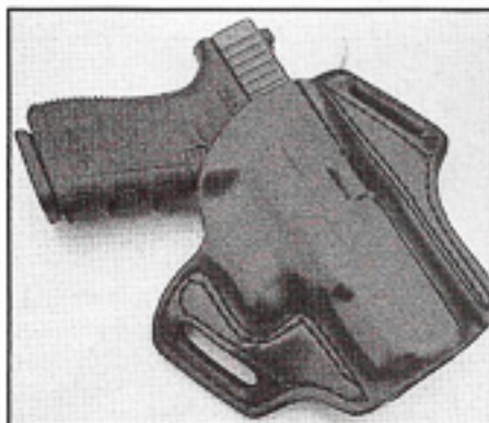
The Express Line 5JR from Mitch Rosen is yet another excellent value.

My sample TSA was set up for my issue GLOCK 32 and has proven both concealable and comfortable. The TSA is precisely molded to the shape of the gun and is available in a variety of colors.