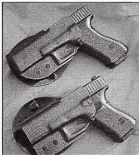
The new DeSantis Jackal represents a good buy. Thumbbreak and belt holster variations are available.