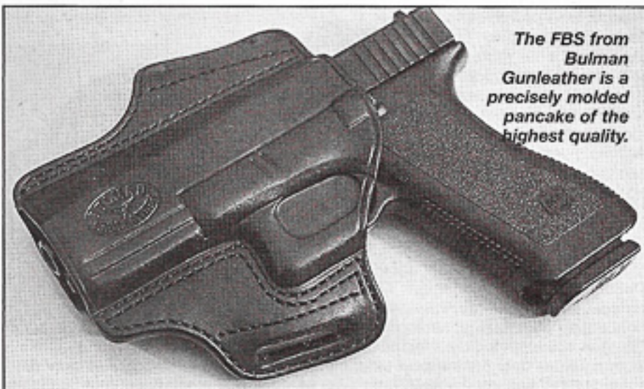
The FBS from Bulman Gunleather is a precisely molded pancake of the highest quality.