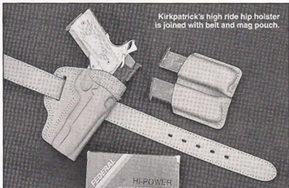
Kirkpatrick's high ride hip holster is joined with belt and mag pouch.

trigger guard. The front lip is cut low, to the rear edge of the gun's ejection port, to speed the draw. The COP is available in plain black cowhide only, with the edges neatly finished. While this is an excellent high ride concealment holster for the civilian, it will also make an excellent duty holster for the plainclothes detective. For the police market, a matching magazine and handcuff pouch is available.